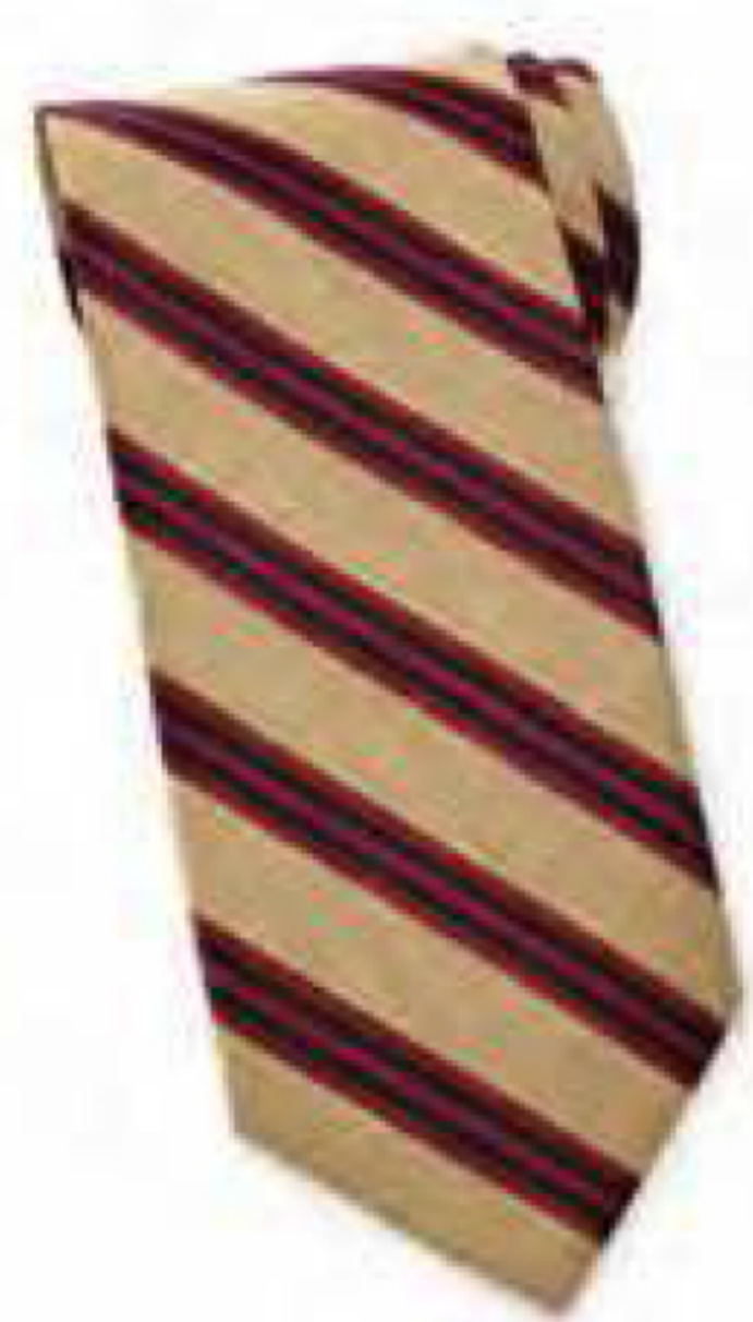
049 Antique Gold