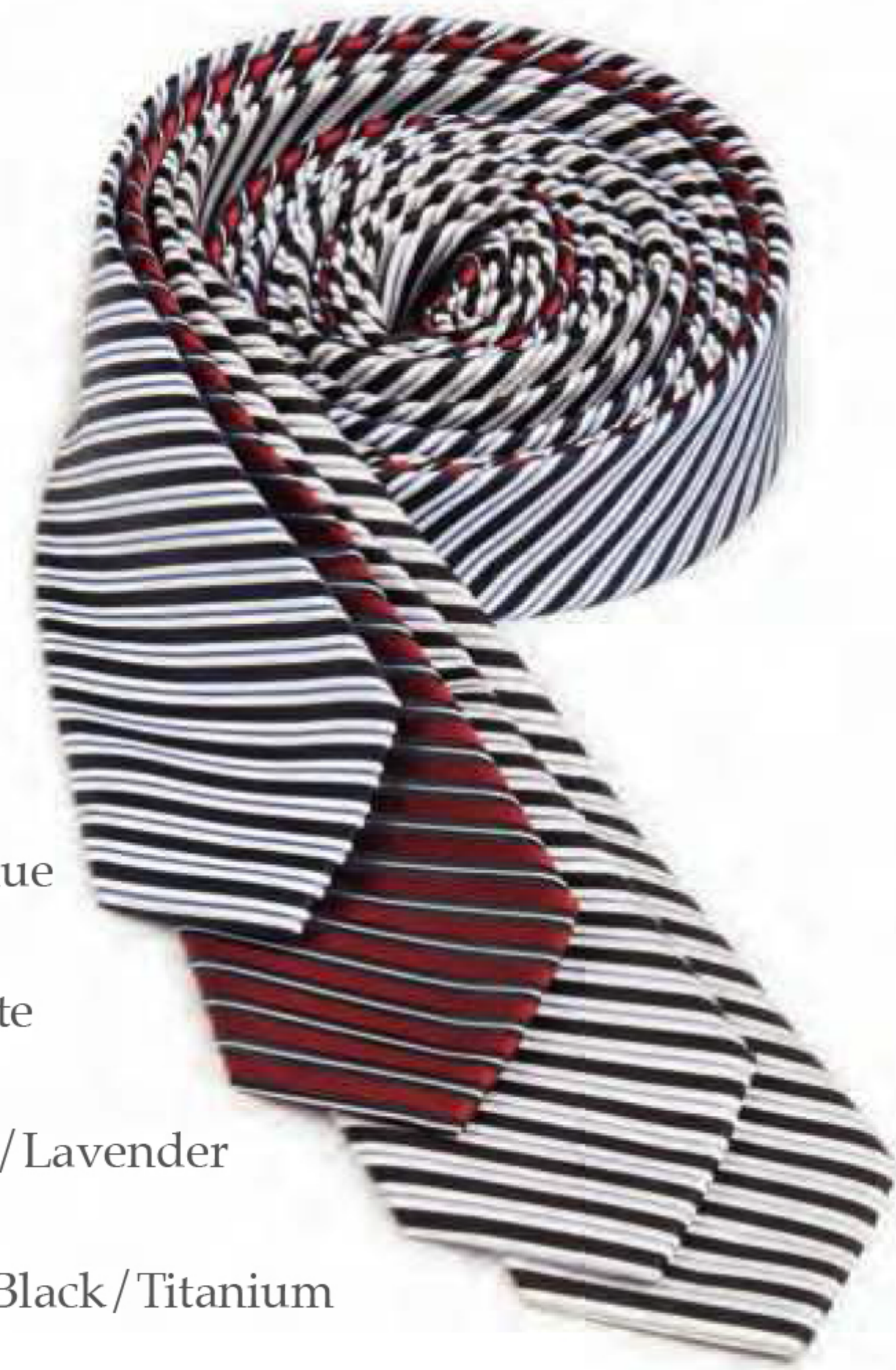
T008 Triple Stripe Tie