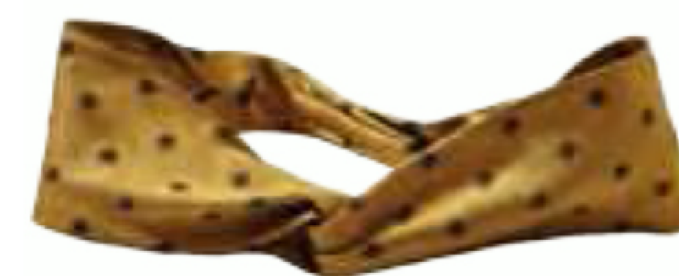
701 Inca Gold