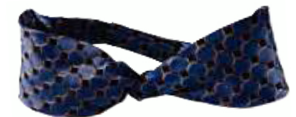
061 French Blue