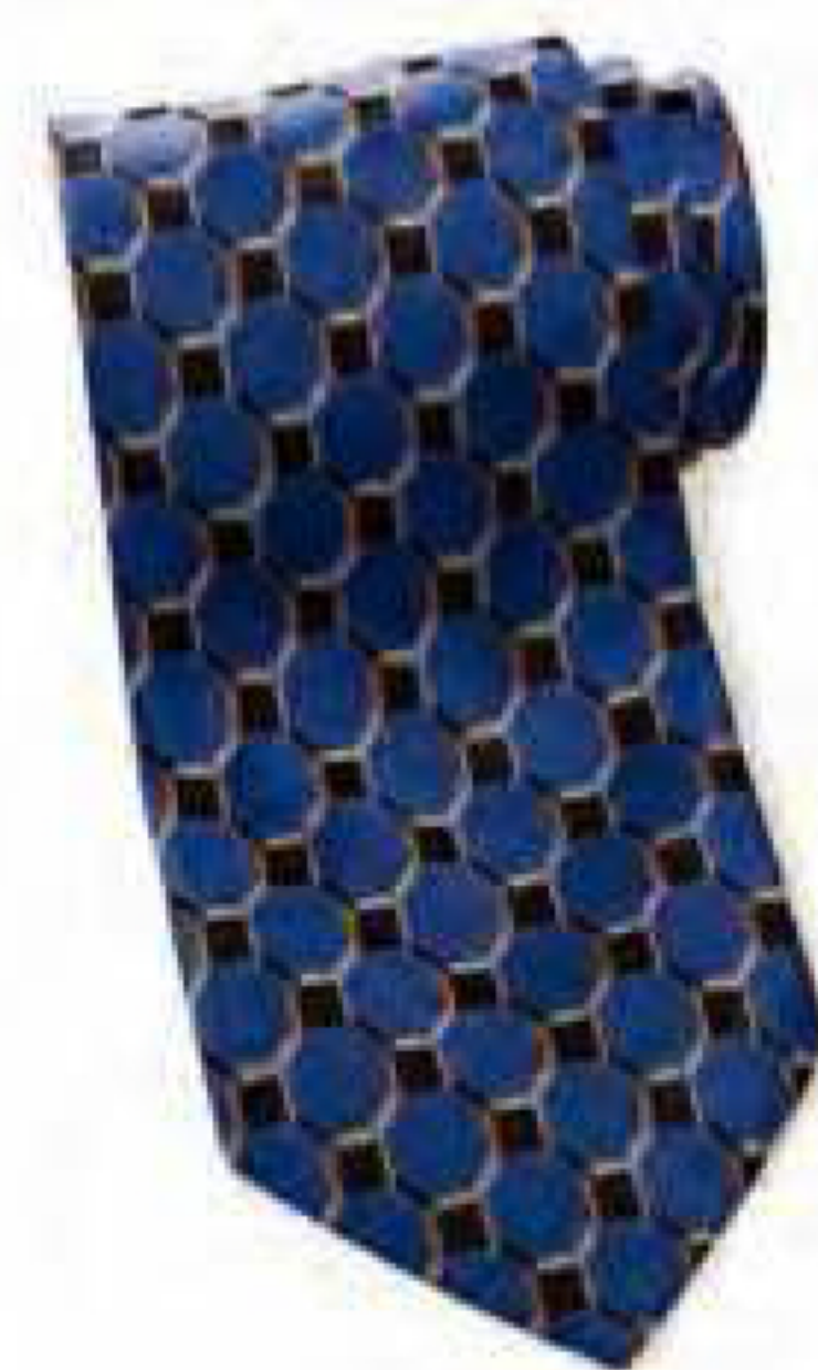
061 French Blue