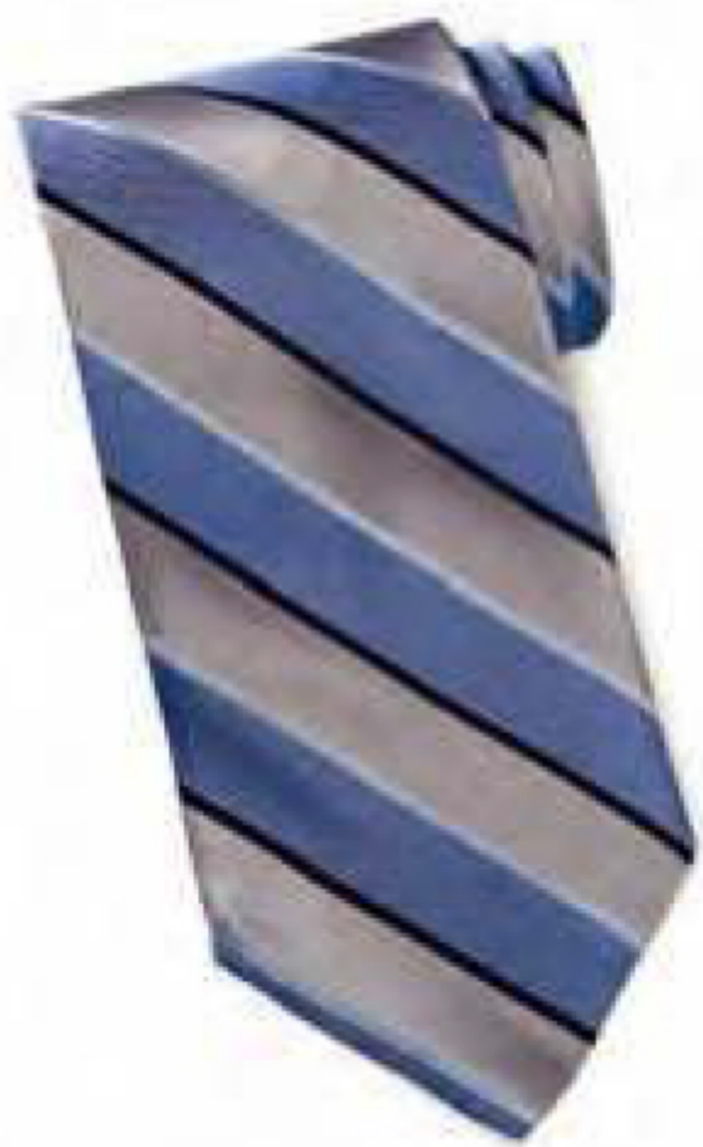
904 Storm Cloud