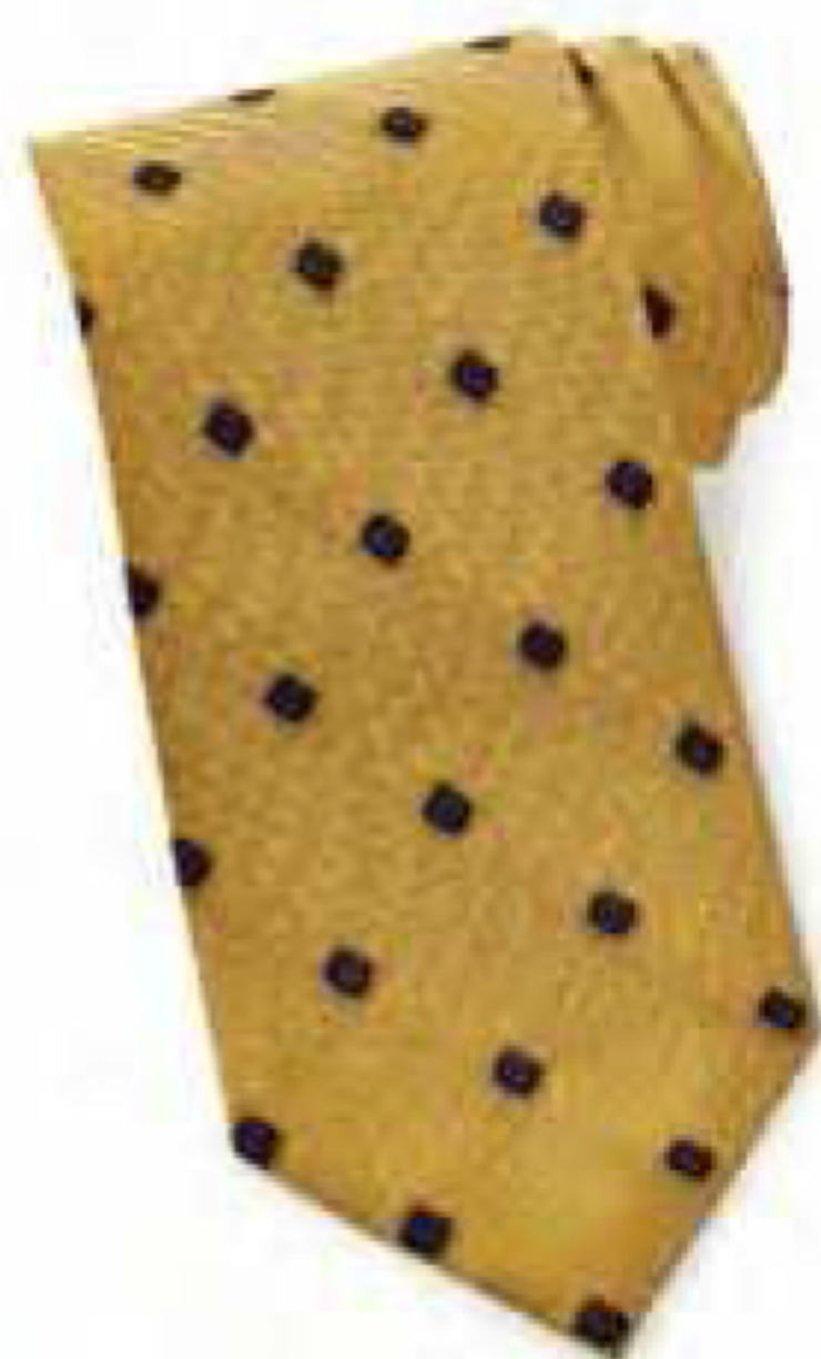
701 Inca Gold