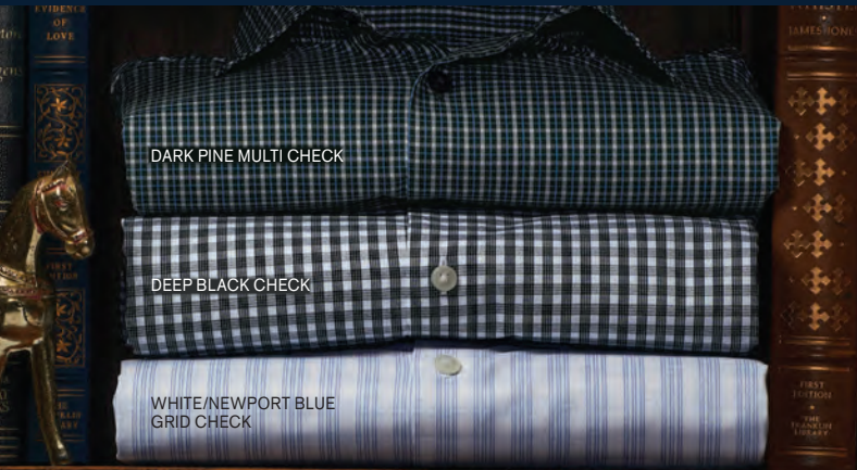
DARK PINE MULTI CHECK