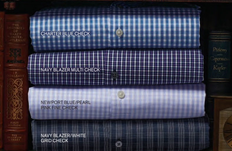
CHARTER BLUE CHECK