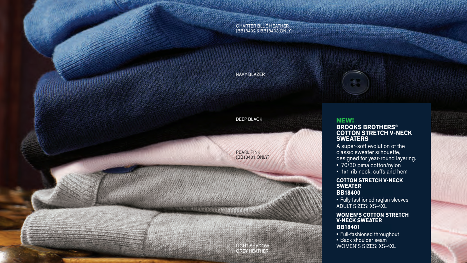
CHARTER BLUE HEATHER (BB18402 & BB18403 ONLY)