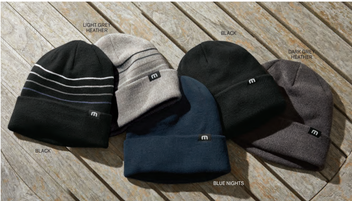
LIGHT GREY HEATHER