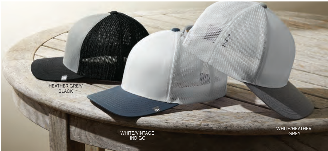
HEATHER GREY/ BLACK